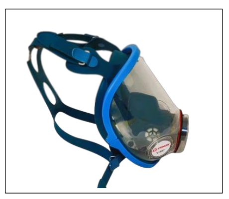
FACE SEAL Available in TPE OR Silicone for a higher safety.

Designed to avoid fogging on the visor through the control of the cold and hot air flows inside the mask instead of using surface treatments that can be easily spoiled.